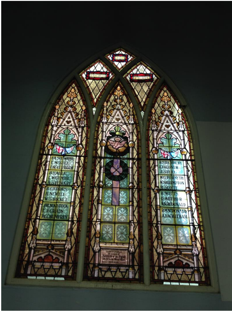
Stained Glass Window located in Presbyterian Church, Parkes