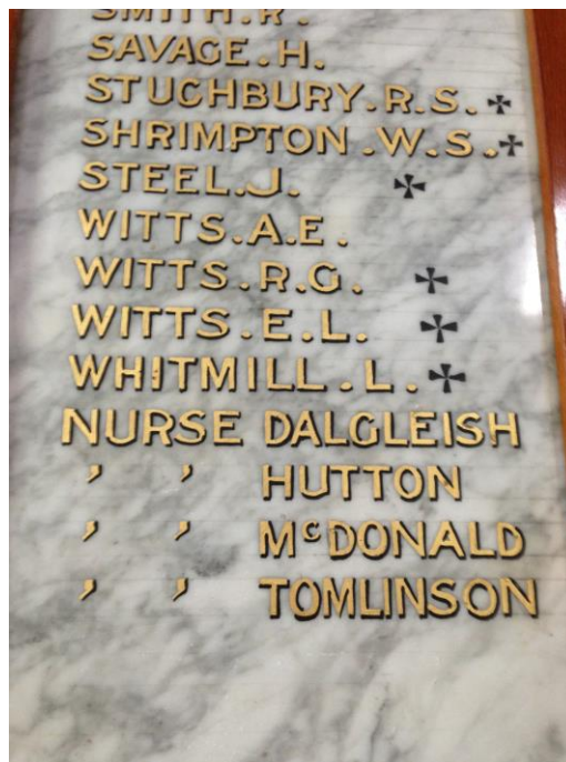
Roll of Honour Board in Presbyterian Church, Parkes