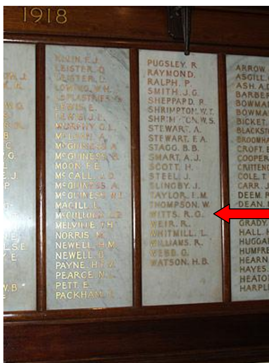
Parkes R.S.L. Roll of Honour